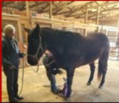
Tammy Blaze comes every Thursday and trims 5 horses. Donations are always needed.