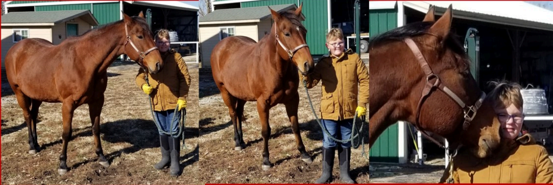
Above—Mazy adopted on Sunday, Nov 13!